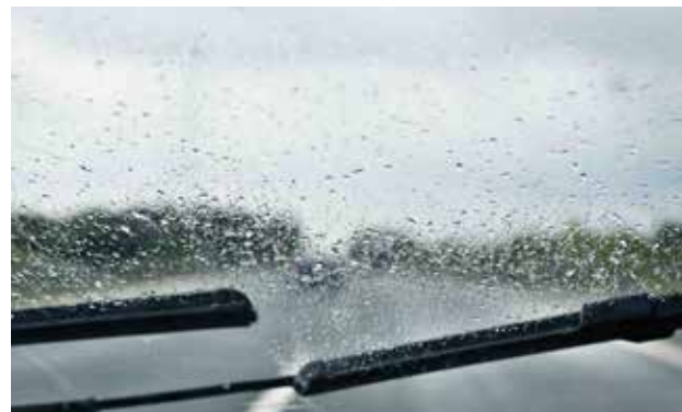
To this...in a matter of seconds.