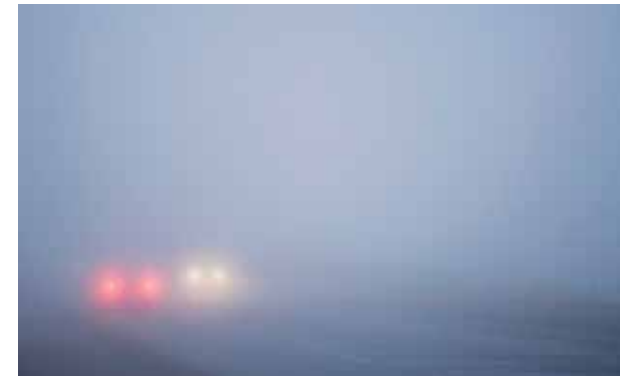
Are you driving fast or slow? In fog you never know. Slow down.