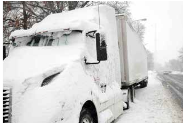
Sweep snow from every part of your vehicle.