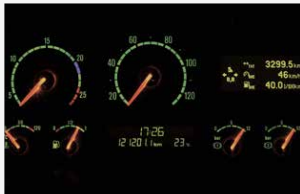
Adjust dashboard lights to give your eyes a break.